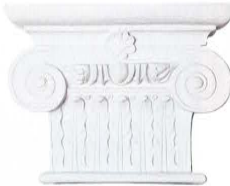
Break the mold with Felber's PILASTER CAPITAL (F487A) . RETAIL PRICE: $47 PER CAPITAL; 800-392-6896/ WWW.FELBER.NET .

Blue and cream stripes and checks liven up any dining room chair. Jag Tar's CANE BRAKE FABRIC in tern, THROUGH DECORATORS AT KIRK BRUMMEL (APPROXIMATE RETAIL PRICE: $130/YARD); 212-477-8590/ WWW.KIRKBRUMMEL.COM . Hodsoll McKenzie's SMALL CHECK FABRIC in Indian blue (#HM485/101), THROUGH DECORATORS AT CHRISTOPHER NORMAN (APPROXIMATE RETAIL PRICE: $102/YARD); 212-647-0303.