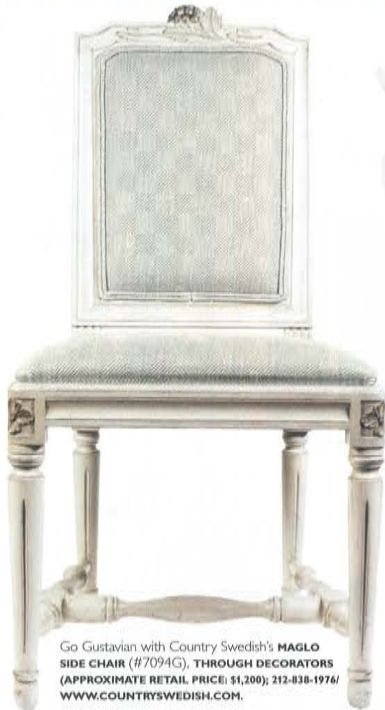
Go Gustavian with Country Swedish's MAGLO SIDE CHAIR (#7094G) , THROUGH DECORATORS (APPROXIMATE RETAIL PRICE: $1,200); 212-838-1976/ WWW.COUNTRYSWEDISH.COM .